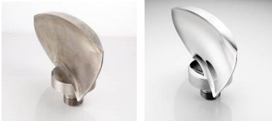
Turbine blade before and after OTEC finishing

\mu\text{m} and often to less than \text{Ra } 0.25 \mu\text{m} . Here, it is especially important to ensure that the shape of the blade is not damaged. Furthermore, the edges can be rounded to a predefined dimension without excessively rounding the corners of the blades. The process times are between 2 and 30 minutes. Several workpieces can be clamped in the machine at the same time, which ensures a very high throughput. The workpieces are lowered into a rotating container filled with a grinding or polishing medium. The actual working motion is generated by the flow of abrasive medium surrounding the workpiece, which also rotates independently.