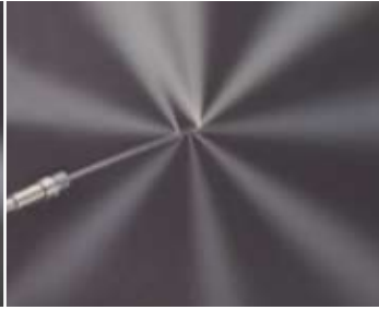
Adapter for the inside cleaning of hollow instruments