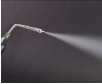
Adapter for connection of catheter