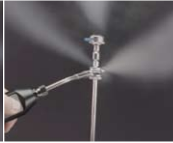
Direct connection of instruments by Luer-Lock coupling device